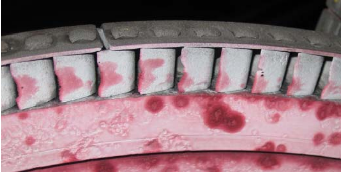
Original Wheel and Buckets