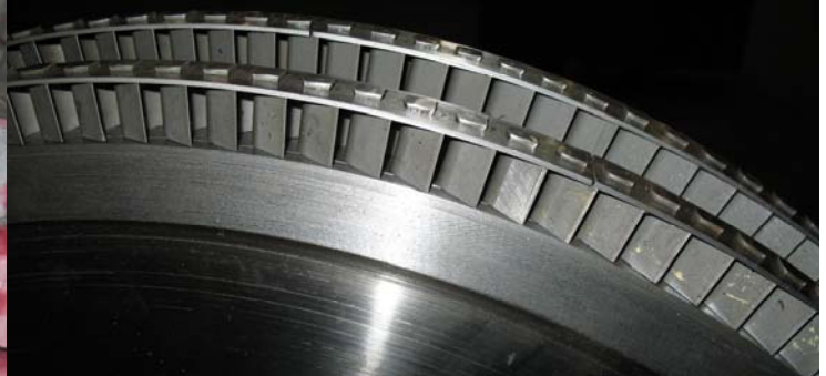
FSM New Wheel and Buckets