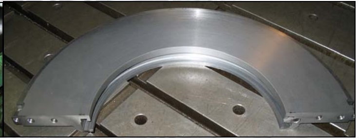
FSM New Packing Seal