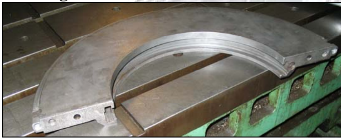
Original Packing Seal