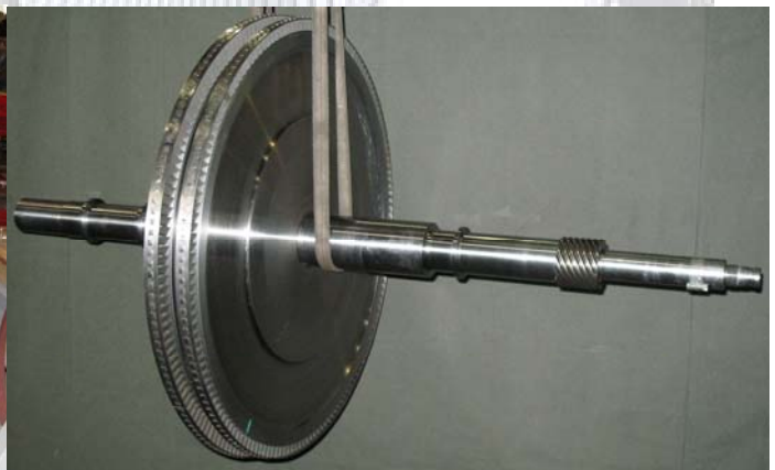
FSM Manufactured Assembly